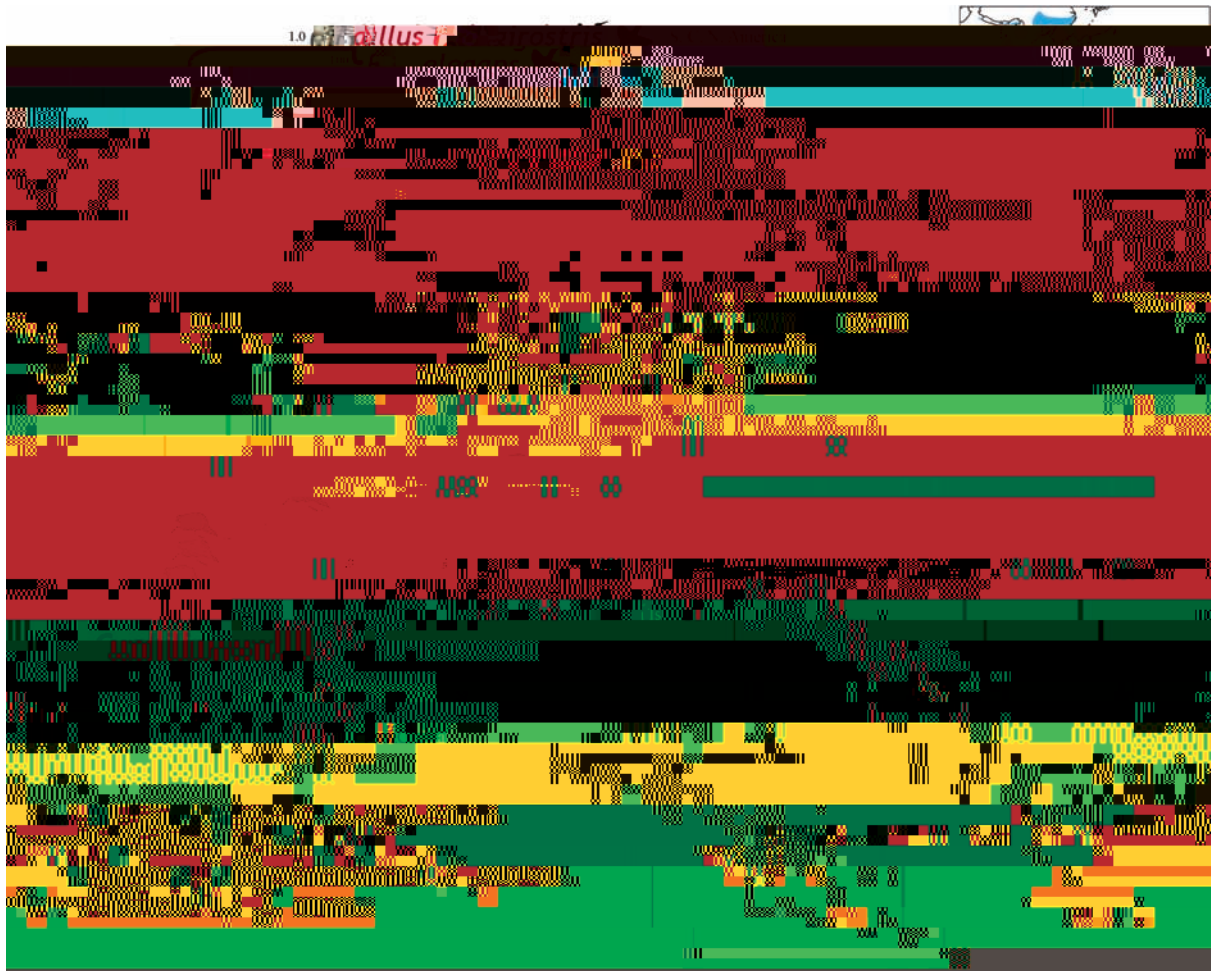
Figure 1. Bayesian phylogenetic inference of the 'Rallus' clade based on concatenated gene analysis. Posterior probabilities over 0.90 and